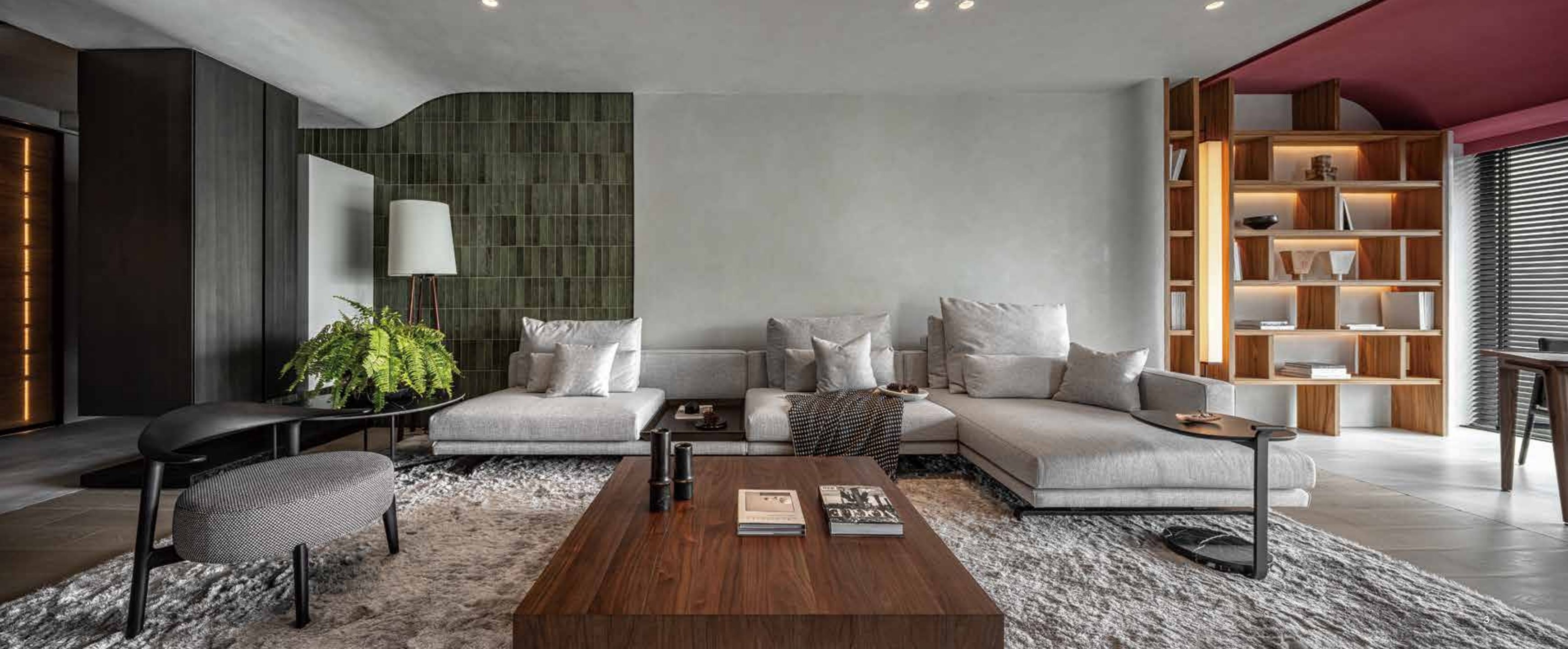
3. 選用前衛的紅色與綠色作為設計主軸。4. 平面圖。